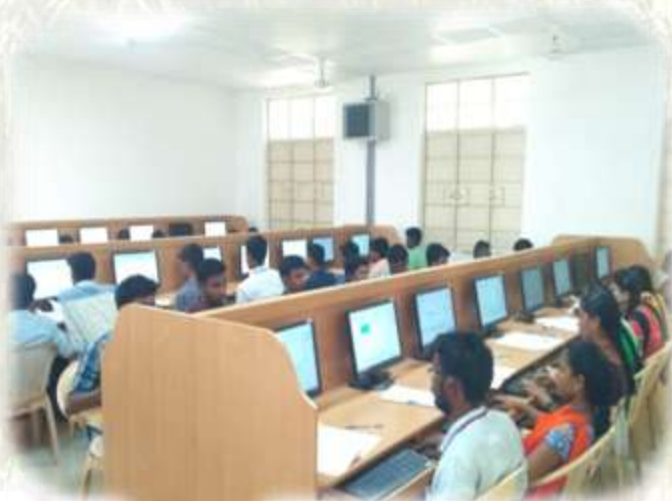
Dr. Radha Thiagarajan Computer Lab