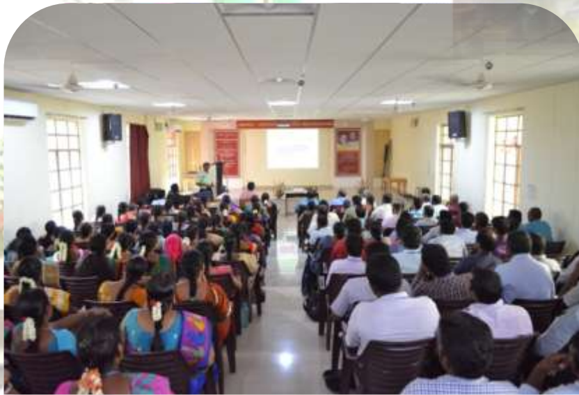
Dr. Radha Thiagarajan Auditorium