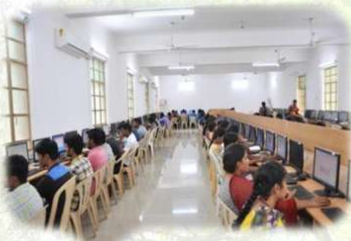
Sri Ramanujan Computer Centre